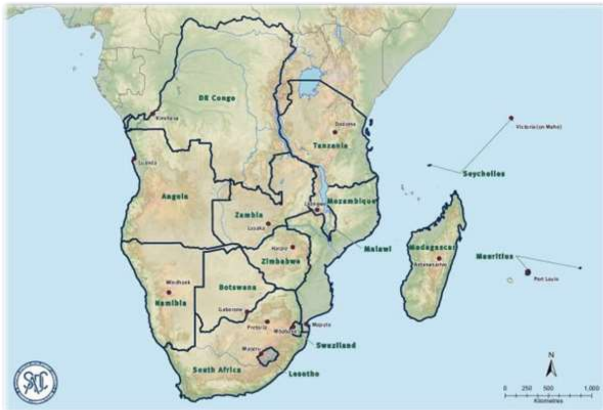
Figure 2.1: Map showing the SADC region and its fifteen member states 8

According to the African Union (n.d) the SADC region (see Figure 2.1) is one of eight recognized regional economic communities within Africa and is situated in the southern tip of the African continent.