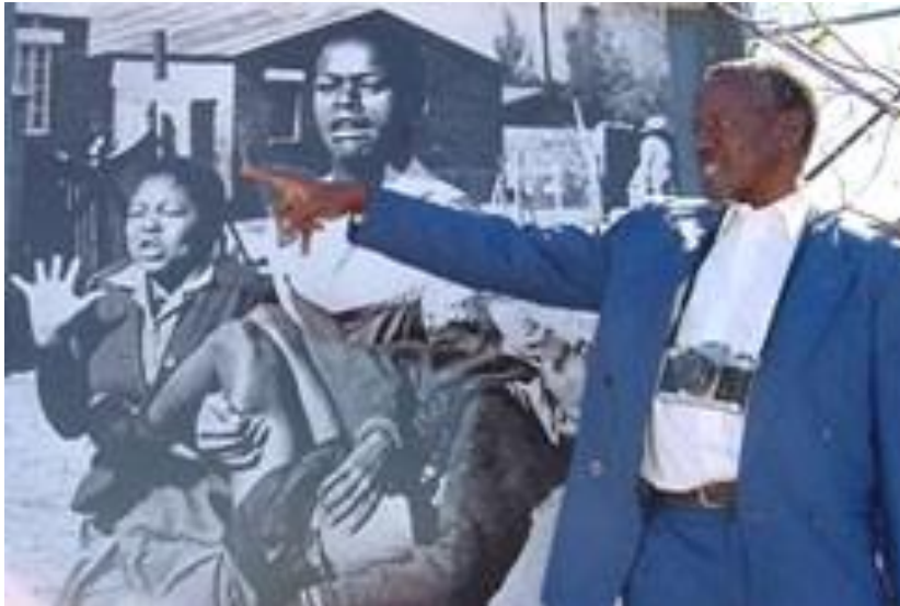
Sam Nzima's photo (1976, June 16) of a dying Hector Pieterse carried by Mbuyisa Makhubo while his sister Antoinette Sithole runs alongside.