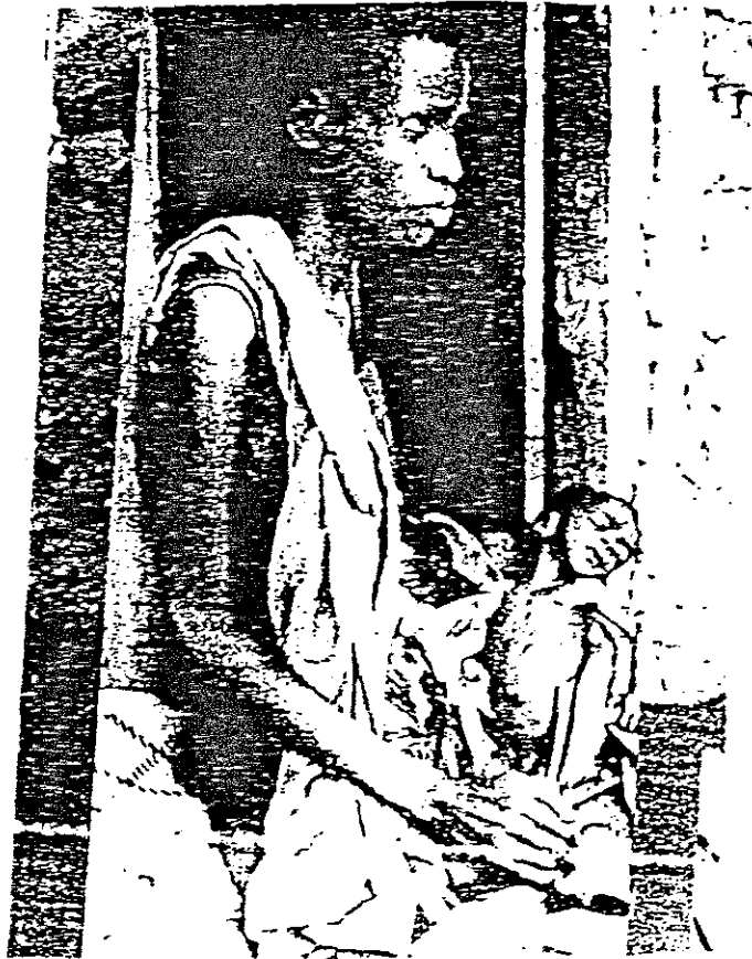
FIGURE 2.1. One of Africa's earliest AIDS victims.

Although in South Africa, the first two cases of AIDS were seen in 1982 (Whiteside, 1990), in Central Africa the magnitude of the existence of the virus became apparent in the latter half of 1986 (Barnett & Blaike, 1992). A similar view is taken by Hooper (2000) who points that Africa's first major Aids epidemic which spread like wildfires across the continent killing hundreds of people every day appeared in 1986. At this time, health workers noticed a rare disease which they termed "slim disease" that caused severe weight loss (Evian, 1995) as shown in Figure 2.1 below.