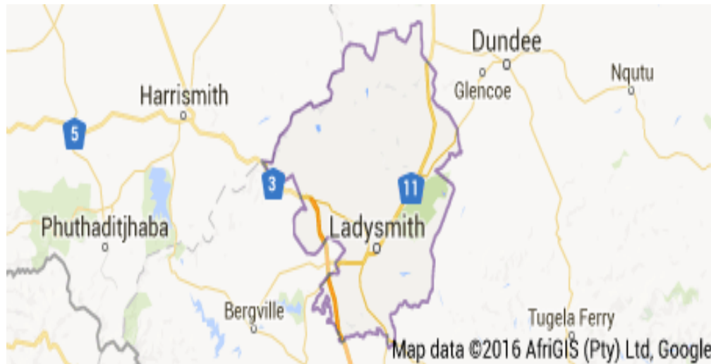
Figure 1: Ladysmith Map

Ladysmith was proclaimed in June 1850 and officially named Ladysmith later that year. The town is made up of 27 wards with thirteen of those being rural wards, some of which are still under the administration of the traditional authorities. Ladysmith forms part of UThukela district which is one of the ten district municipalities in KwaZulu-Natal.